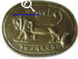
Seal bearing the inscription to Shema, servant of Jeroboam, from Megiddo (Israel Antiquities Authority)